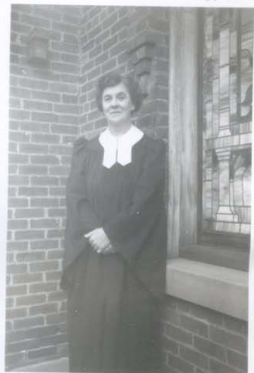
Mother in her long service to the church as pianist