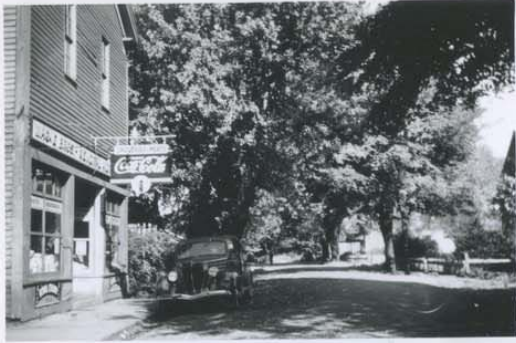
Dabson St. looking N. from the Barber Shop