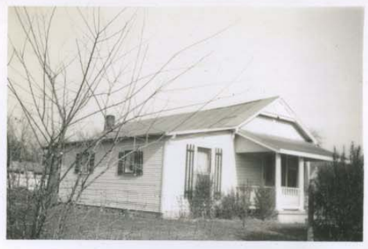
The Giffin present home