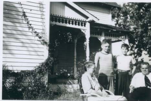
The Family in the yard