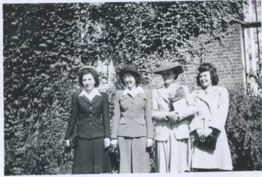
"Old Grads" Class