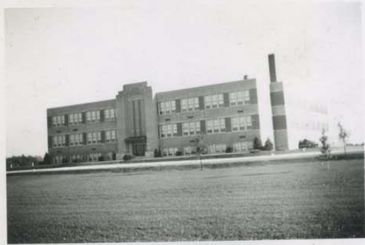
Pike Township School - front view