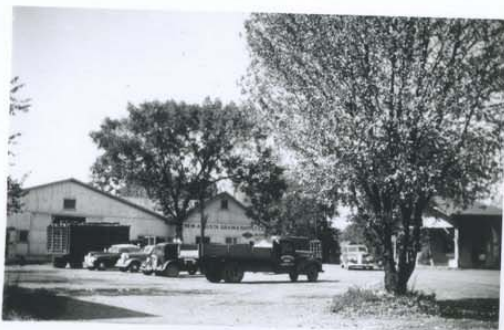
New Augusta Garage