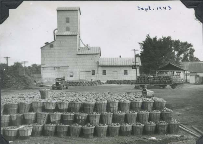
New Augusta Grain & Supply at height of tomato season - surplus waiting for shipping