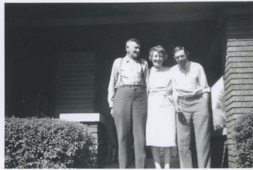
Grandfather, Mother and Father