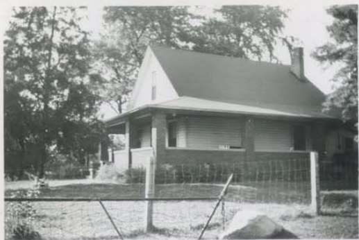
The old Home