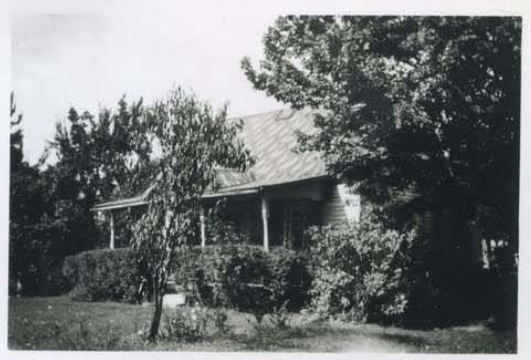
The Family Home (could never find the family at home)