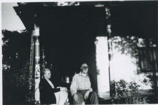
Mother and Father