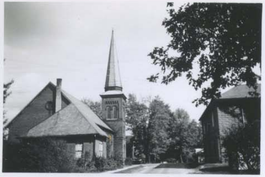
Church on left - Masonic Hall on right from West