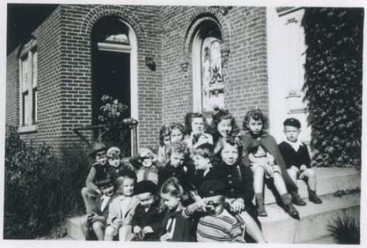
Primary Room - South side of Church During services before promotio