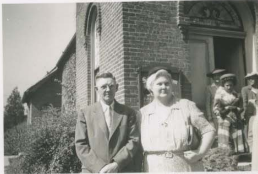
Father and Mother at Church