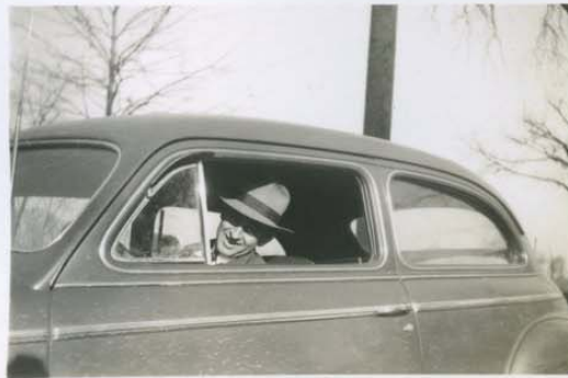
The mail man - Bryan Fox, uncle