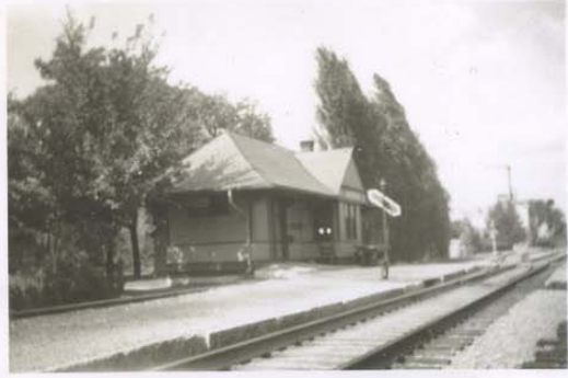
New Augusta Depot, looking north