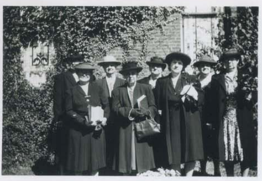
Good Samaritan Class