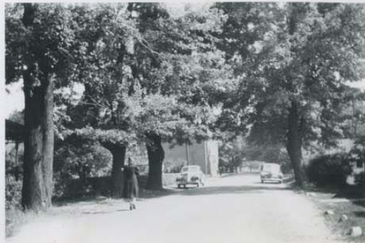
Walnut St. looking E from church (Mrs. Ely going home from services)