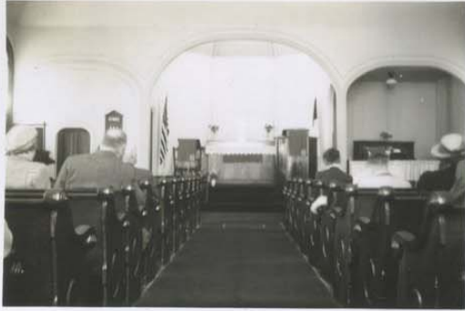
World Communion Sunday before services

General Pictures sent to each Service Man