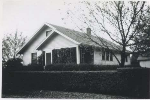
The old Homestead