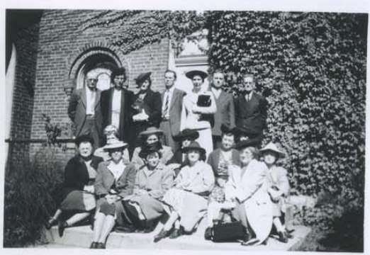
Good Will Class and Men's Class