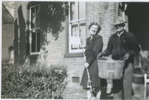
Mother and Dad moving