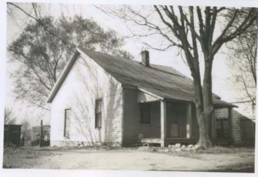
The Giffin home on Michigan Rd. (just vacated)