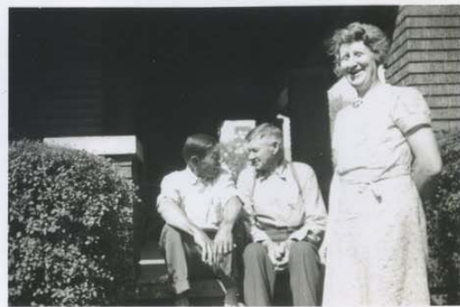
An interested family group