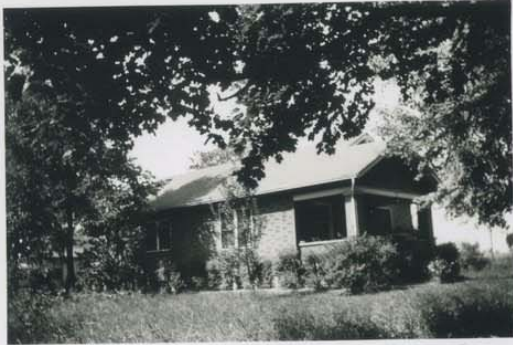
SE view of front of Home