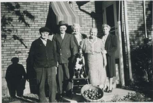
Parents and Grandparents + friend