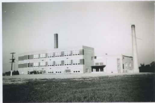
Pike Township School - from SW - showing new gym unit.