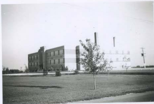
Pike Township School - from NW