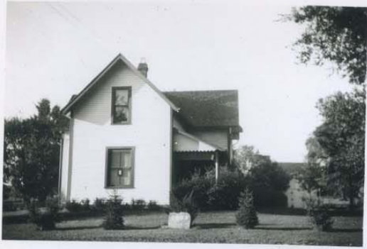
The Old Home