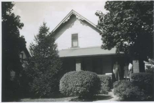
The old Home