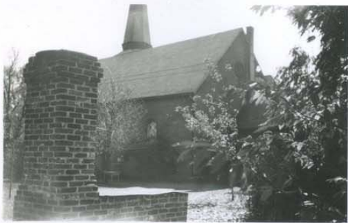
The lawn furnace and church rear view