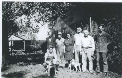
New Augusta Grain & Supply workers