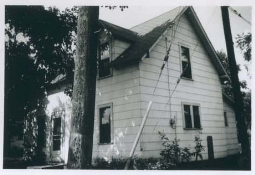
The Old Home