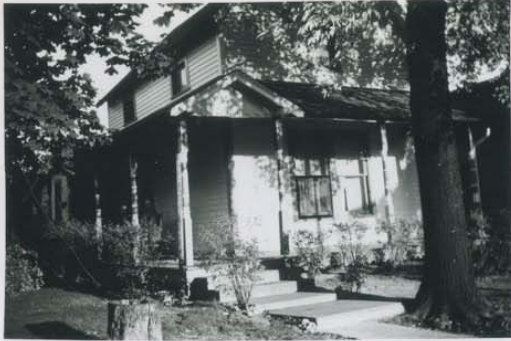
The old home