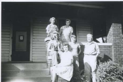
The Home Folks