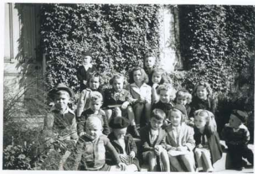
The Primary Kiddies (before promotion)