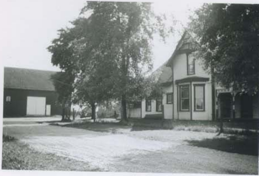
The old home