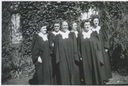
The choir, World Communion Sunday