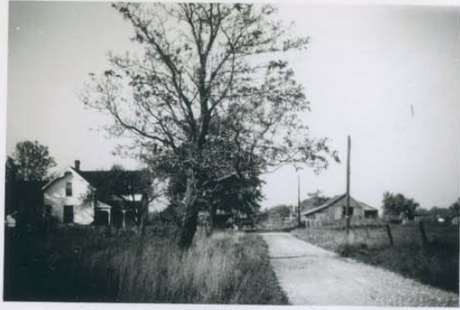
The Old Homestead