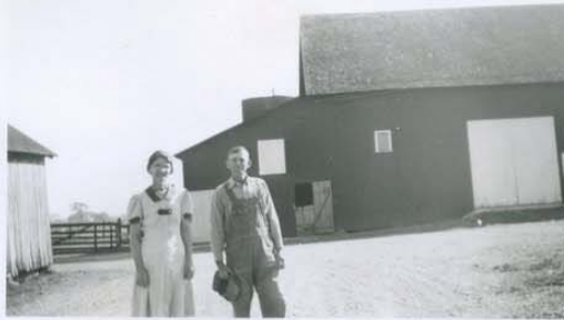
Mother and Dad