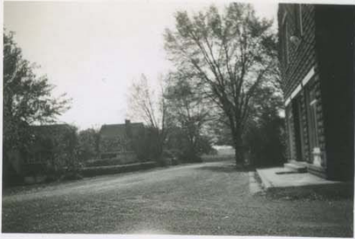
Ballard St. looking S. from church