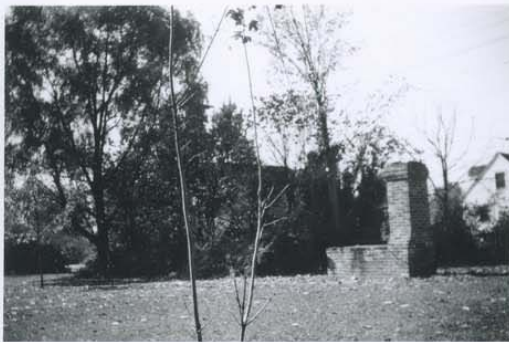
Back of church lawn and fire place. scene of many fish fries and social hours