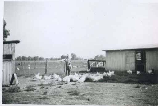
Dad's flock of white rocks