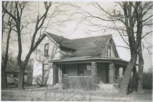
The Esther Fox Home