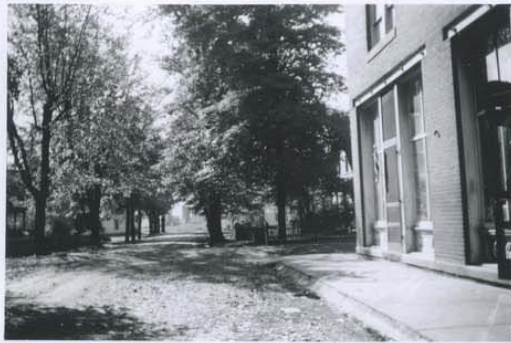
Dabson Street looking S. from Magle's Store