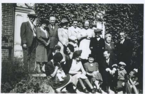
Harvest Home Dinner Group