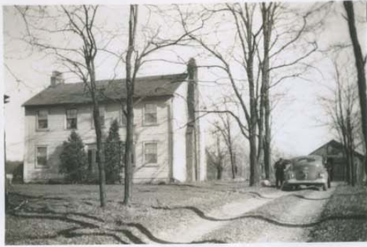
The John Bryan Home