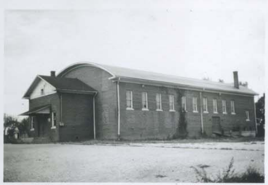
old Gym and Community Hall - from SE - scene of many exciting times!