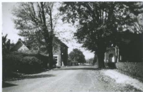
Walnut St. looking N. from Post Office