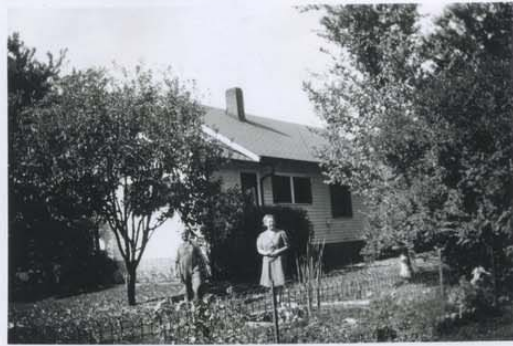
The Old Homestead