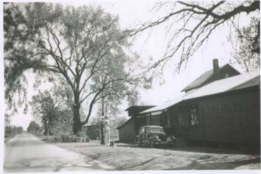
E.J. Klingensmith's Store on Highway Through South edge of village (from N.W.)