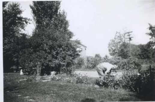
"Dad" in the flower border.