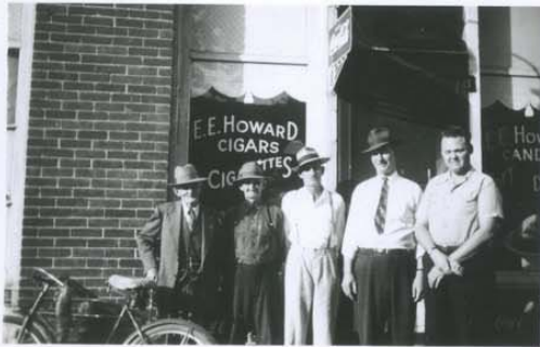
Loafers at Everett's