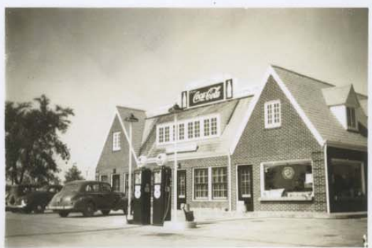
Highshues' Corner - from SW.