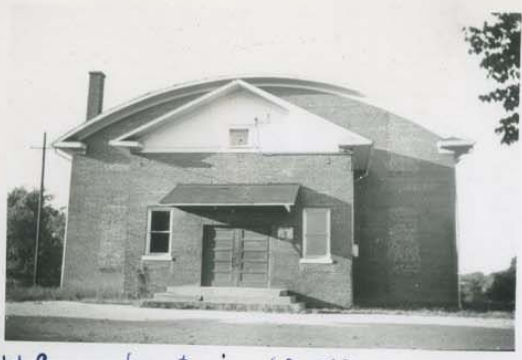
Old Gym - front view (South) front all as the original old school building before converting to gym