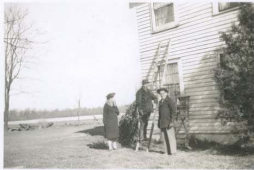
Putting up the storm sash The John Bryan Home