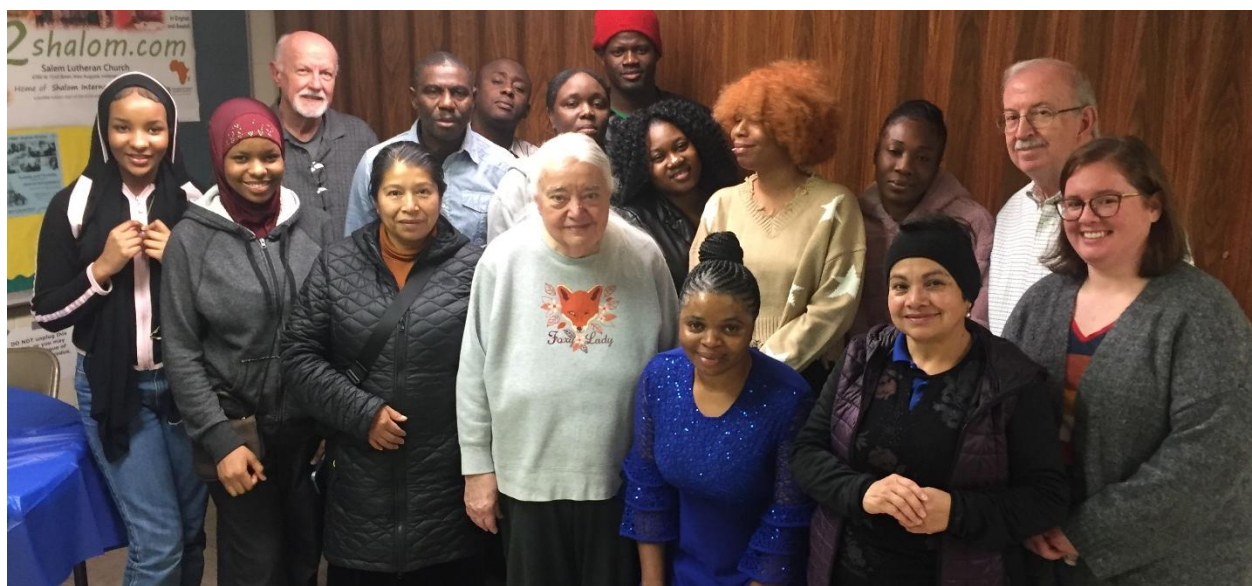
The ESL class and staff pose for a group picture at the fall celebration on November 26, 2024.