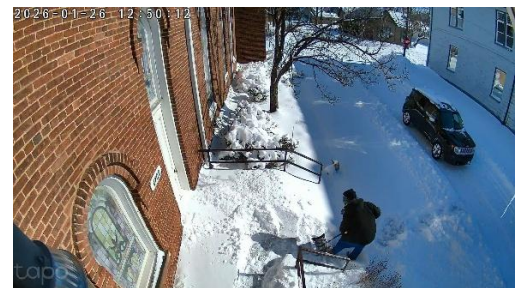
Above: one of the five cameras mounted outside and a sample of the images they capture.